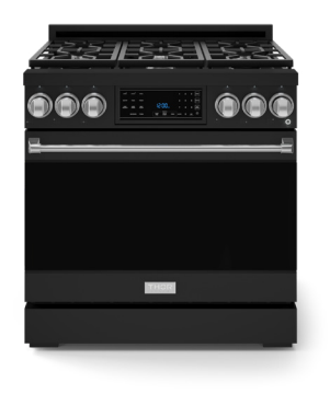
STAINLESS STEEL RSG36B-SS / RSG36BLP-SS