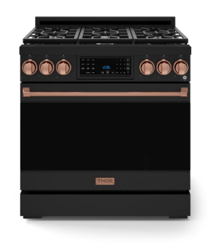
ROSE GOLD RSG36B-RSG / RSG36BLP-RSG