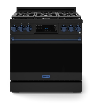
BLUE RSG36B-BLU / RSG36BLP-BLU