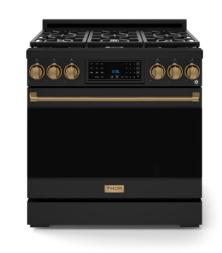
BRONZE RSG36B-BRZ / RSG36BLP-BRZ